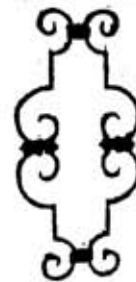
#1 H-14" W-7"