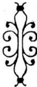
#20 H-15-3/8" W-7"