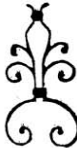
#3 H-13-1/4" W-7-1/2"